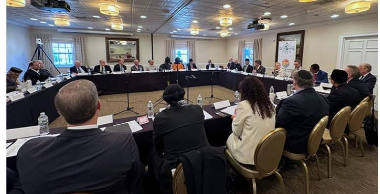
UDHR 75th Anniversary Conference at Princeton University, USA

The first meeting was a response to the crisis between Hamas and Israel; the second conference celebrated the 75th anniversary of the Universal Declaration of Human Rights (UDHR). These may sound like unrelated topics, but they are not. What if the current crises of humanity have to do with the dysfunctional roles of religions in society, and also with a loss of moral