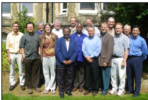
TC Study Unit meeting at Oxford, 2008

The book can be purchased through William Carey Library and good theological book stores.