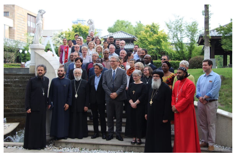
The Faith and Order Commission of WCC meeting in Nanjing

The minutes of the World Council of Churches Faith and Order Commission's meeting of 13-19 June 2019 in Nanjing, Thomas now available. China are Schirrmacher, a consultant to the Commission, commented, 'Everybody concerned about the future of ecumenical relations should especially follow the papers of the study groups, which map the growing friction on moral issues between and within churches around the globe and try to find ways to discuss the relevant topics in peaceful dialogue.' Two reports from the meeting and information on how to order a free copy of the full document are available at: Documents of the WCC Commission on Faith and Order.