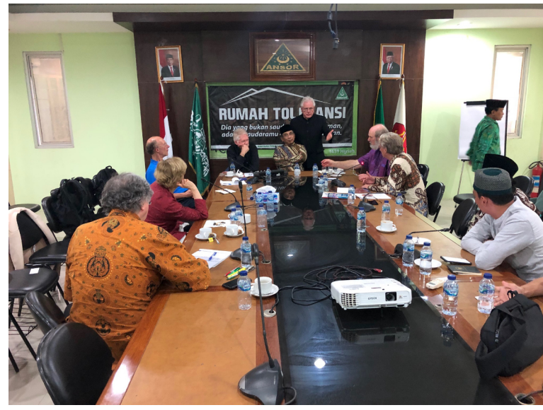
Nahdlatul Ulama and WEA participants during their discussion period.

In 2018, NU's youth organization, Gerakan Pemuda Ansor, released the Nusantara Manifesto, which argues that rad-