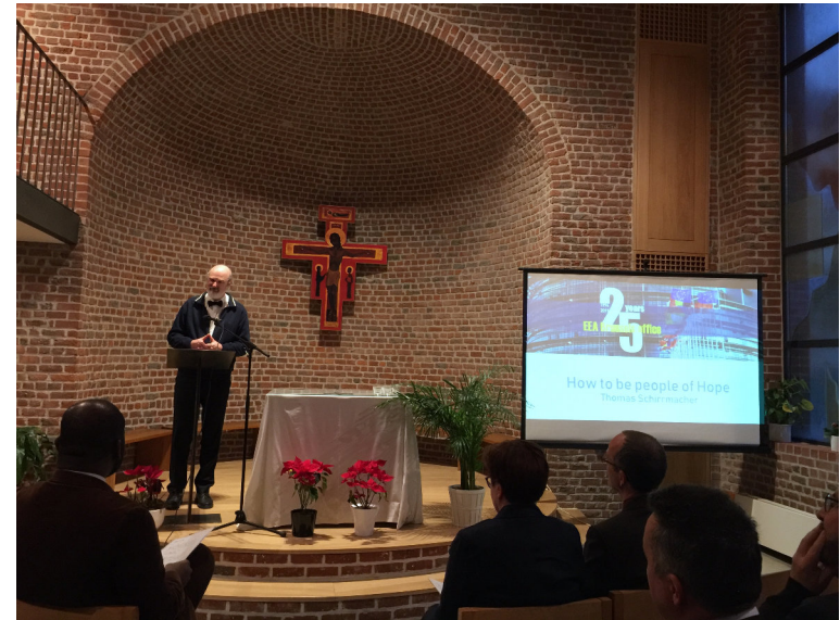
Thomas Schirrmacher speaking in the Chapel for Europe

The EEA reaffirmed its commitment to advocating for a civil public square open to a wide variety of voices, including evangelical ones. In the run-up to the