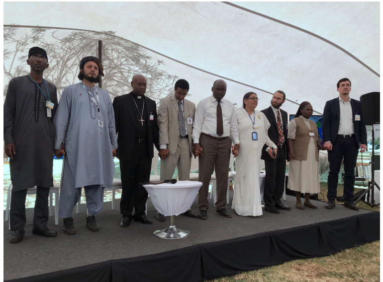
Representatives of various faith traditions at a side event in the context of the Faith for Earth Initiative at the UN Environment Assembly (2019)

The UN Inter-institutional Working Group on Religion and Development was established in 2010. It is intended to develop political guidelines for cooperation with faith-based actors and to deepen the expertise of UN personnel with regard to interfaces between religious groups and UN activity in the areas of development, human rights, peace and security.