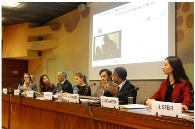
The panel at the launch of the FORB Learning Platform

A second series of four short videos on 'Access to Justice' is also available. (continued on next page)