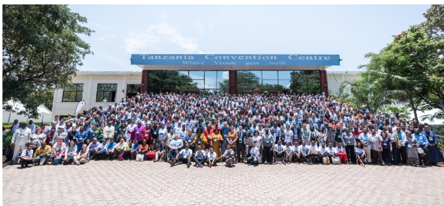
All 1,000 or so conference participants managed to fit into this picture!

It was refreshing to see a deliberate emphasis on developing younger leaders, partly because a Global Ecumenical Theological Institute programme took place during the days immediately before the main conference, with many young theologians participating. Indeed, the speakers who made the biggest impressions on everyone I spoke with were young women.