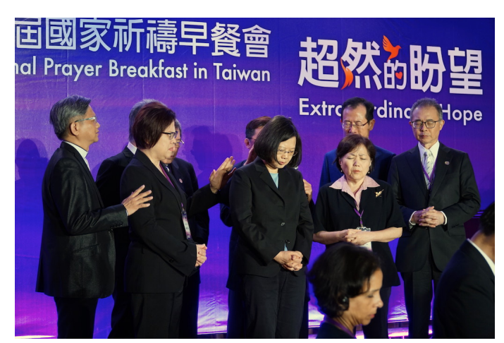
President Tsai Ing-Wen speaking at Taiwan's National Prayer Breakfast

The two WEA representatives, both from Germany, also attended a CBMC reception which included guests from Korea, the Philippines, Vietnam, and Israel, who reported on the political and spiritual situation in their countries.